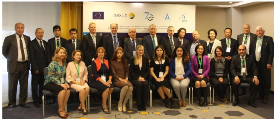
3 RSC, 12 Oct. 2018, Astana