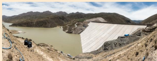
Misicuni multi-purpose dam, Cochabamba – Bolivia

Published by Deutsche Gesellschaft für Internationale Zusammenarbeit (GIZ) GmbH Registered offices Bonn and Eschborn, Germany Nexus –Water, energy, food security Av. Sanchez Bustamante N° 504 Calacoto, Casilla 11400 La Paz, Bolivia T +591 (2) 212 4353 F +591 (2) 291 6791 int. 102 E Rafael.Wiese@giz.de www.water-energy-food.org www.giz.de/bolivia