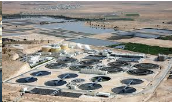
Kherbet El-Samra WWTP - Jordan