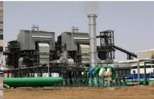
Kenana sugar company- Sudan