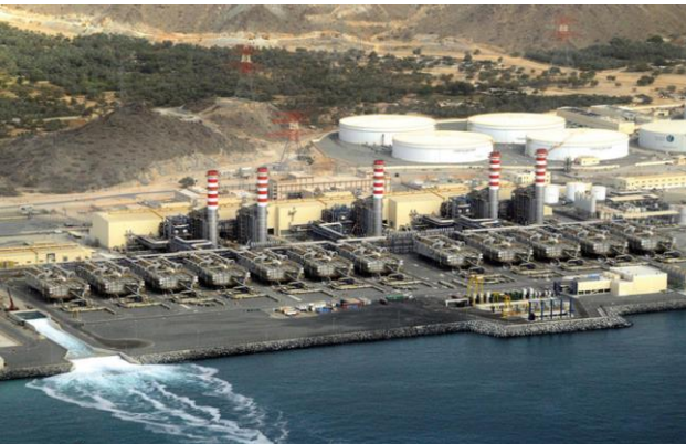
Fujairah desalination plant - UAE