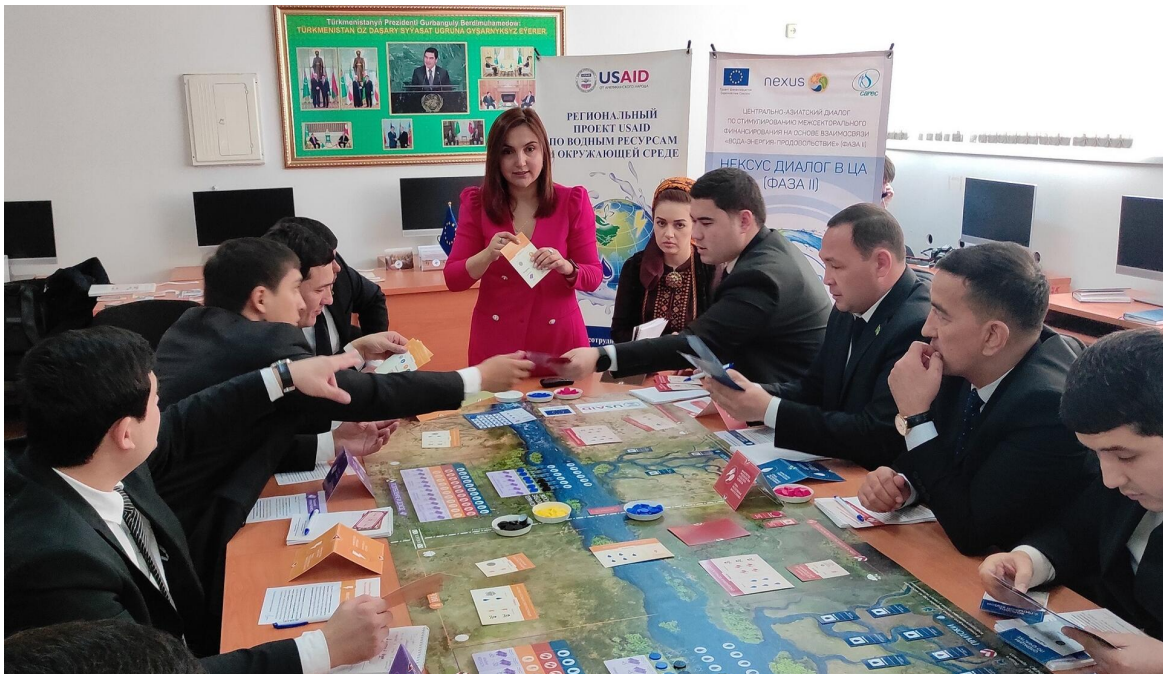
The Interactive Nexus Simulation Game in full swing.

On the 7th and 10th of February 2023, thirty three lecturers and professors from the Academy of Civil Service under the President of Turkmenistan and the Turkmen Agricultural Institute learned about the interactions between water, energy, food and environment security through the Interactive Nexus Simulation Game.