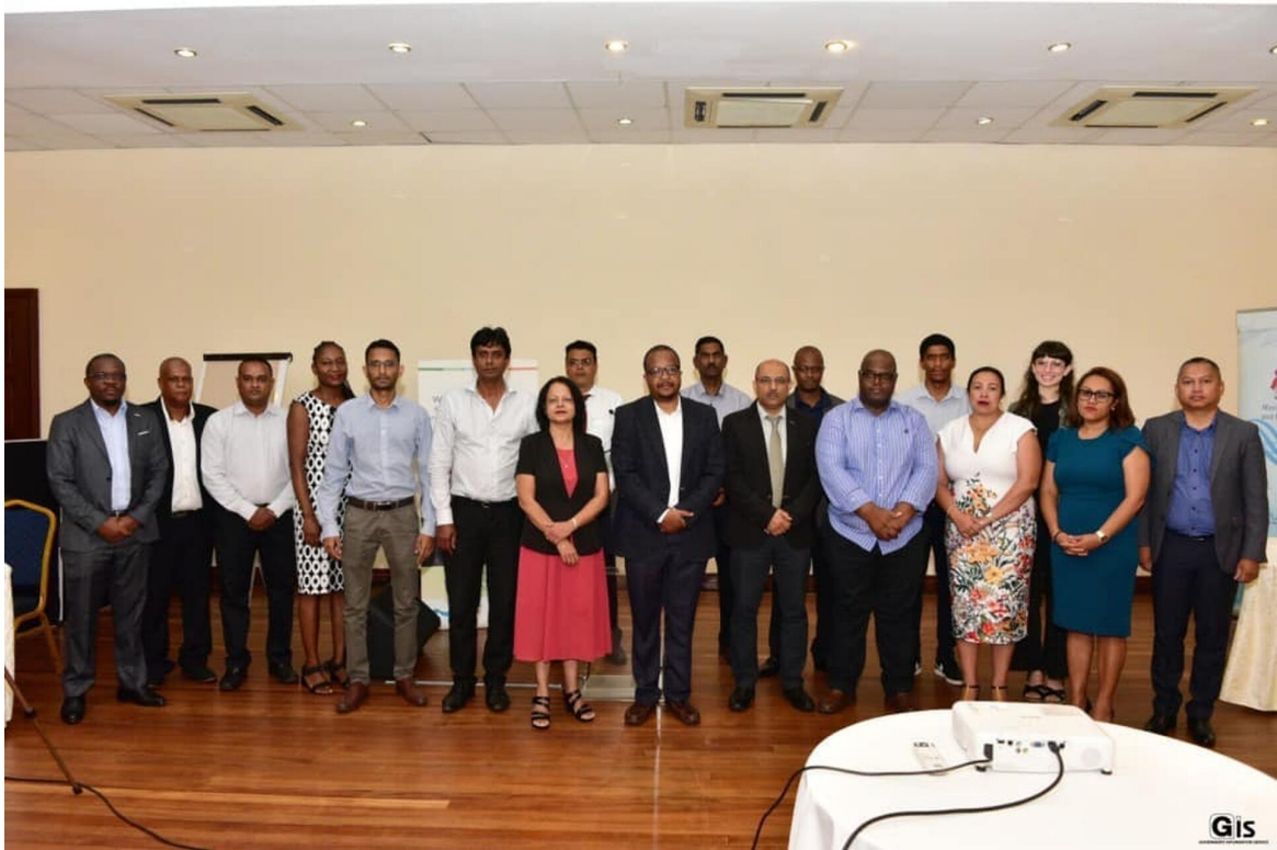
Regional SADC workshop participants pose for a group photo.