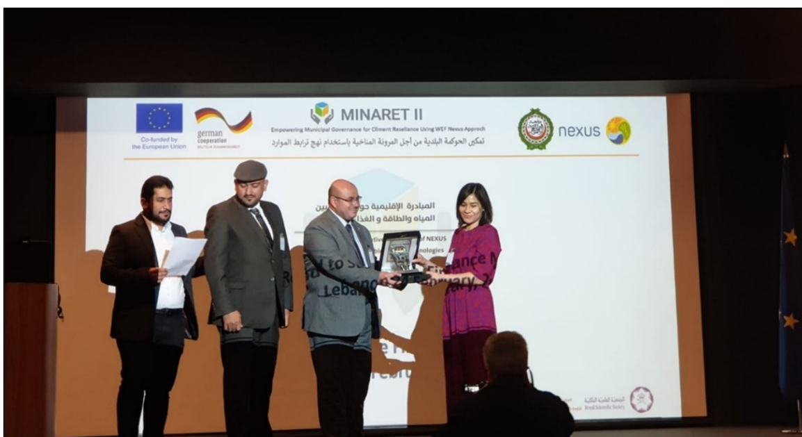
Closing ceremony of the MINARET II Initiative.

“Road to Finance – Nexus Thinking and Decentralisation of Subnational Governments” was the title of the MINARET II Project Regional Meeting that took place in Beirut, Lebanon on the 24th of February to mark the closing of an 18-month initiative to strengthen the climate resilience of municipalities in Lebanon, Tunisia and Jordan.