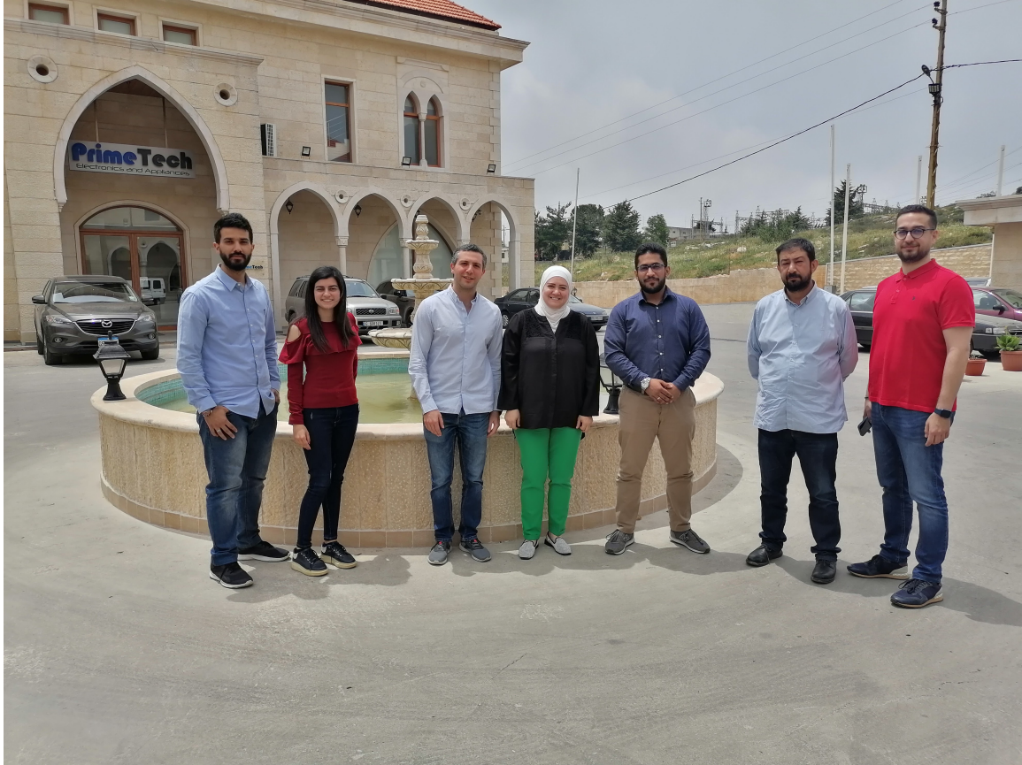
The MINARET II Project team.