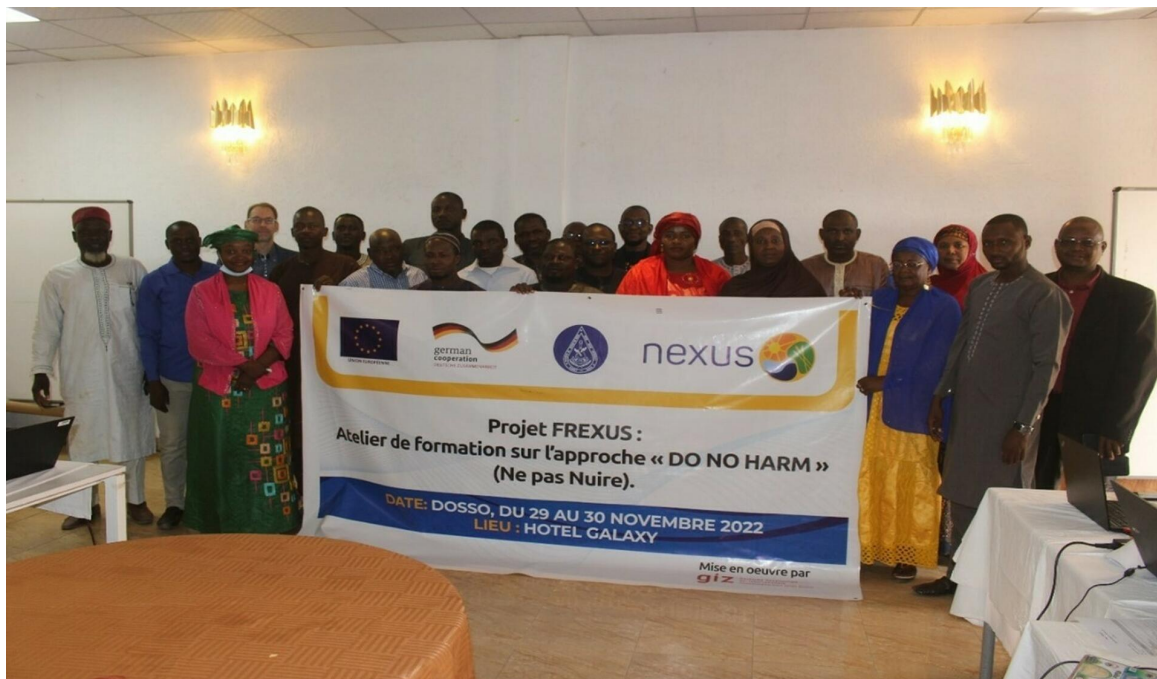
Group photo of participants at the "Do No Harm" workshop in Niger.

Governance aspects have been identified as key conflict factors in the Frexus Project intervention areas, training of local actors in natural resource conflict management and prevention has been undertaken. Training workshops on the « Do No Harm» approach were conducted in each intervention country. These trainings enabled the actors to acquire an approach and effective tools for the management of land, natural resources, and ecosystems.