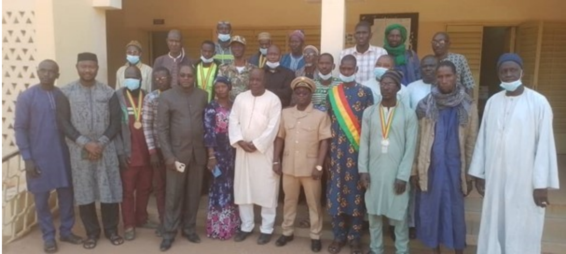
Group photo of local actors involved in the signing of the convention in Bellen, Mali.