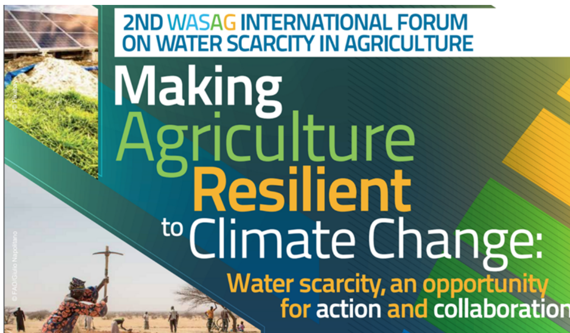
The 2nd WASAG International Forum.

First launched in November 2016, the Global Framework on Water Scarcity (WASAG) has grown into a partnership platform of exchange on solutions to adapt to climate change in agriculture. It has since then held two international forums, the first one marked by the adoption of the Praia Commitment in March 2019. The 2nd WASAG International forum took place in Praia, Cabo Verde from the 7th to 10th February 2023.