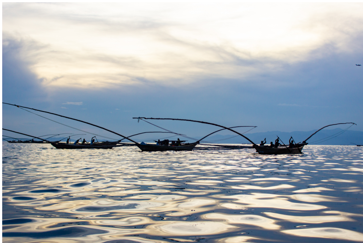
Fishing Boats at Lake Kivu; Rwanda

The basin baseline study documents the current state of the basin’s water resources and natural environment while also identifying current strengths, weaknesses, opportunities, and threats in the basin. The study takes a holistic WEF Nexus approach, analyzing the interlinkages between water, energy, food security, and the natural environment. The study was drafted in close cooperation with GIZ project partner and basin organization ABAKIR (Autorité du Bassin de Lac Kivu et de la Rivière Ruzizi/Lake Kivu and Ruzizi River Basin Authority).