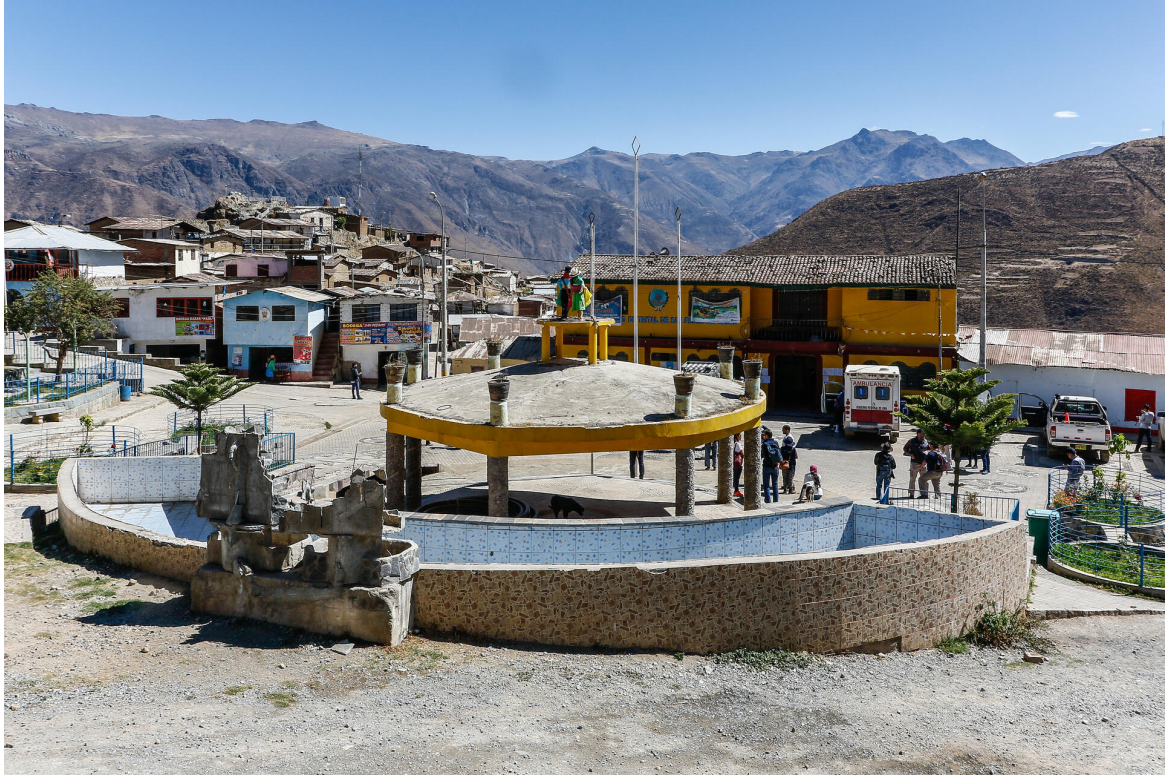
Main square of San Pedro de Casta.

This article presents a pilot project of the Nexus Regional Dialogue in Latin America and the Caribbean (LAC). Bringing together ancestral water sources with solar power, crops and livestock, the project seeks to build food security and prosperity in San Pedro de Casta, Peru, through a practical demonstration of the water, energy and food security (WEF) Nexus approach.