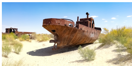
Aral Sea Desert

of the Central Asian Preparatory Conference for the 9th World Water Forum