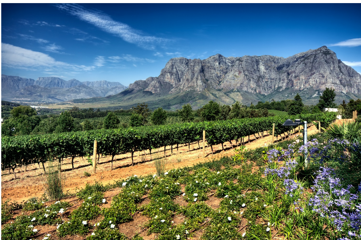
Stellenbosch vineyards mountains