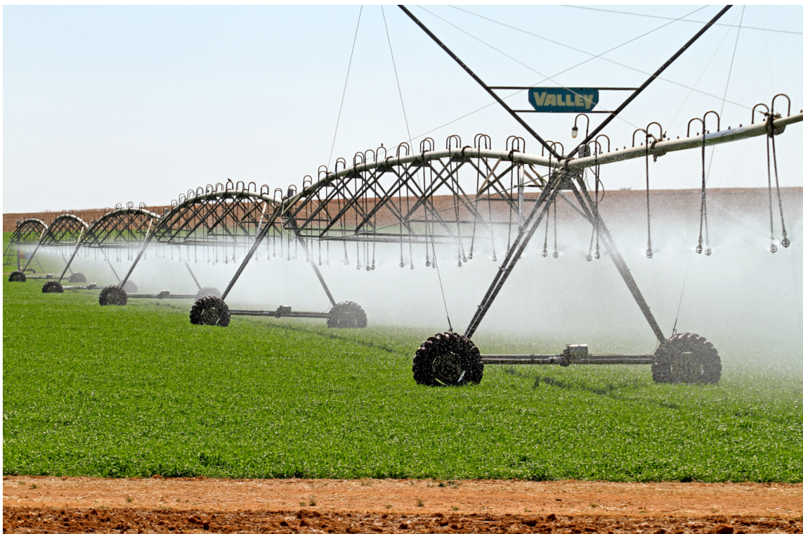
Irrigation System South Africa

Water resources are being placed under an unprecedented amount of stress especially in the context of climate change. This calls for an urgent response to achieve improved, more resilient and more sustainable agricultural water management. A White Paper by The Global Framework on Water Scarcity in Agriculture in a Changing Climate (WASAG) sets out six key principles to guide policy makers' efforts to strengthen water and food security.