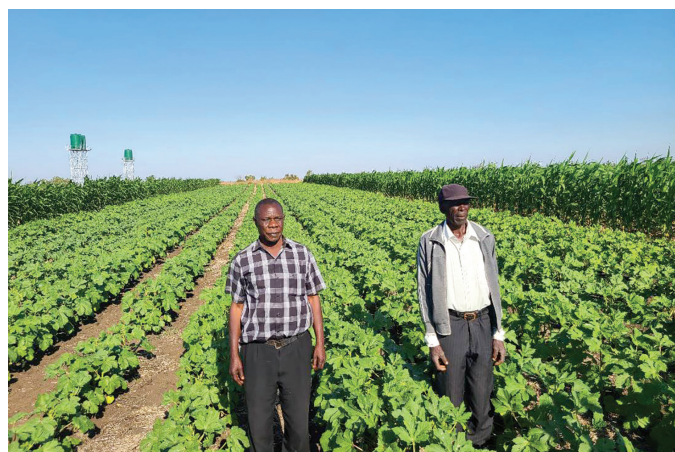
Some beneficiaries in a WEF Demonstration Project field in Zambia