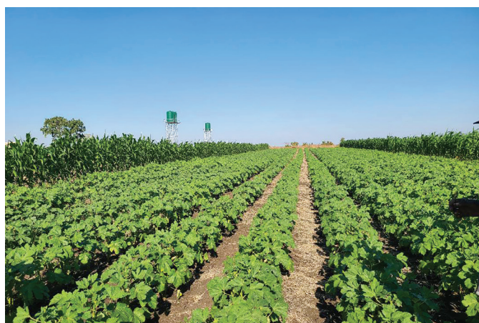
WEF Demonstration Project in Zambia