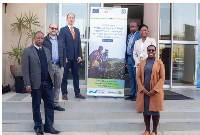
WEF Nexus Project Team including the financiers- EU, implementers SADC, and implementing partner GWPSA