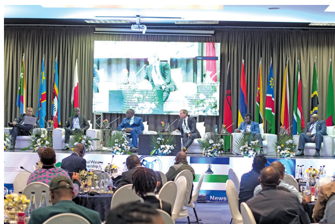
Delegates follow a panel discussion at the 10th SADC Multistakeholder Regional Dialogue in Lesotho