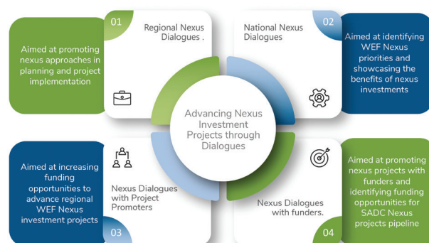
Figure 3. Nexus Investments projects through dialogues

The activities include organizing national and regional Nexus dialogues. The WEF Nexus regional and country dialogues will provide platforms to bring together stakeholders from the three sectors and establish a common mechanism for coordination between the three sectors.